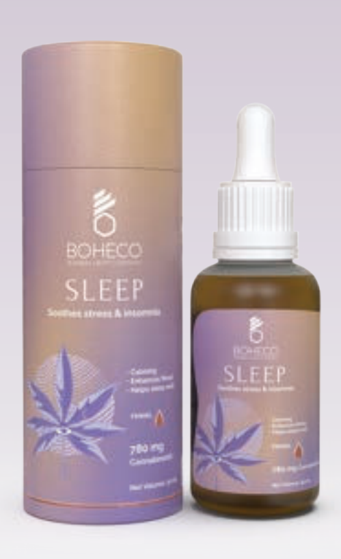
30 ml ₹ 3,449